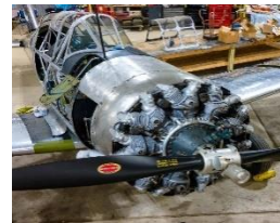
BT 15 VALIANT PICTURE

Wings of the North specializes in restoring vintage airplanes through volunteer efforts. I contributed to the restoration of a 1940s WW2 plane Vultee Aircraft Bt-15 Valiant. Worked on the spark ignition and piston assembly for the Wright R-975-11. Further calibrated and tested anemometers and the control system on the flight.