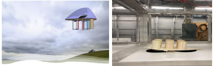
SKYWINDFARM DESIGN and LAB SCALE PROTOTYPE

Launched and led the SkyWindFarm project, partnering with Dr. Biswas at the University of Minnesota. Developed a lab-scale prototype, reaching TRL 4. Submitted a first author manuscript in a top energy journal and obtained a provisional patent. The project, surpassing current AWEs in economy by 25%, involved extensive wind tunnel testing, earning $30,000 in grants.