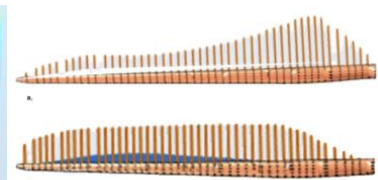
Comparison of total thrust at 0° and at 3.5° for R.2 LLJs

Research Internship Director – Shreya Dixit Foundation June2023-August2023