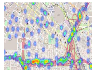
Accident Heatmap used for AI data Training.